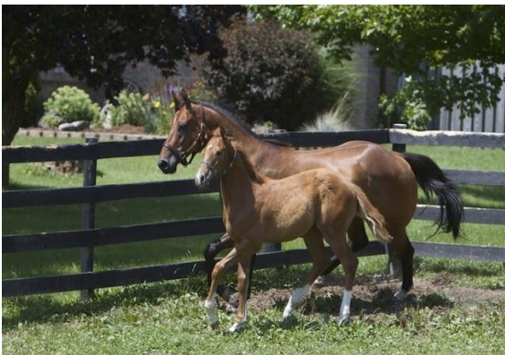
Bye Me One Kool Bud had the look of a champion as a foal with his dam One Kool Bud!